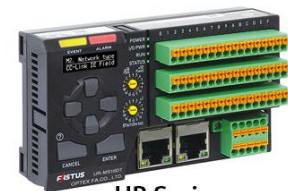
UR Series IO-Link Master

The UR-DS Series IO-Link Hub unit converts 1 CH of IO-Link ports in IO-Link Master to 16-point of digital I/O and is expandable up to 256 I/O.