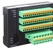
UR-DS Series IO-Link Hub

The UR Series IO-Link Master is available for various industrial ethernet protocols, including CC-Link. With a first in the industry mixed connection of digital Sink(NPN) and Source(PNP) I/O devices realized in one unit.