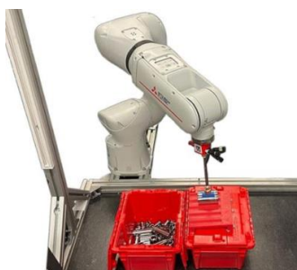
3D Bin Picking